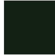
pine green limited edition